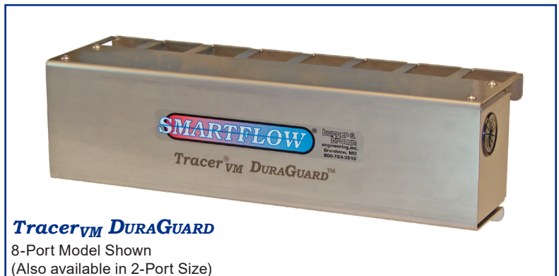
Tracer ® VM DURA GUARD 8-Port Model Shown (Also available in 2-Port Size)