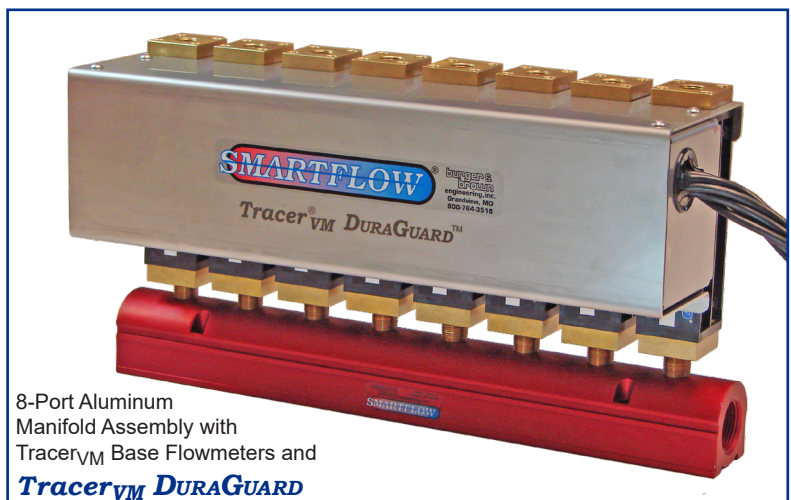
8-Port Aluminum Manifold Assembly with Tracer ® VM Base Flowmeters and Tracer ® VM DURA GUARD